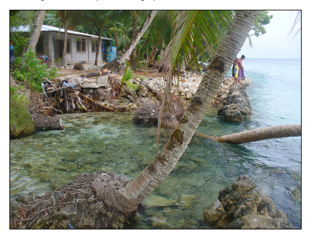
Figure 3: Erosion on Moch Island

Ten years ago when I was small boy I used to dig, to work and to eat from this taro patch. Right now, no more taro. It's about five years ago we no longer use this taro patch, no longer plant the taro inside.