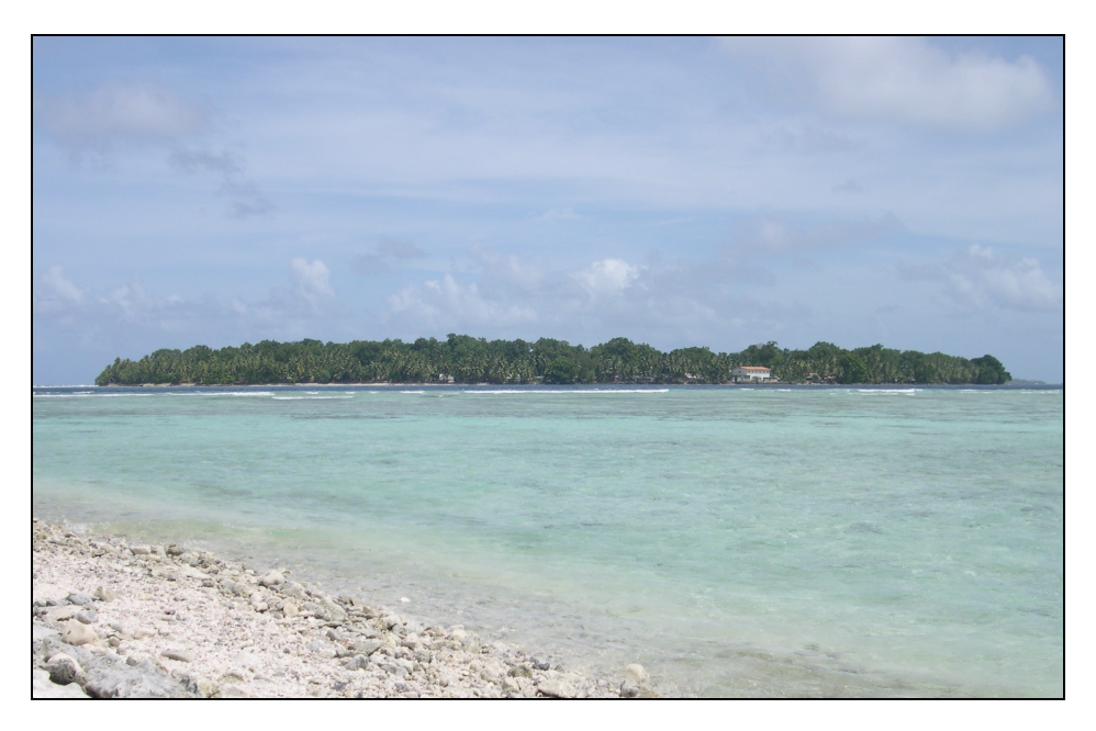
Figure 2: Moch Island, 2008

Our fieldwork on Moch (Figure 2) consisted of formal interviews and informal discussions with people about their experiences of climatic events, the changes they have noticed on the island, and what the causes of these changes might be. The interviews were formally arranged through appropriate community channels by Mr Doropio Marar. We conducted five formal interviews with three men and two women, all of whom were over 60 years old and considered to be elders of the community. The interviews were open-ended and semi-structured around particular themes relating to the causes and effects of climatic events and noticeable environmental changes on Moch. We interviewed people at their homes, and walked with them as they showed us the special places affected by typhoons, storm surges and 'high tide'. Interviews were also actively solicited by two younger men who were eager to share their experiences of extreme climatic events and to show us the impacts of climatic events on their island places. Permission was granted to audio-tape the interviews. Informal discussions and conversations occurred regularly throughout our time on Moch and contributed significantly to the study.